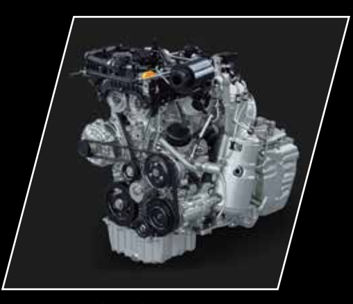
1.2L turbo petrol engine with 82kW power and best in class 200 Nm torque for quick acceleration and fast overtaking