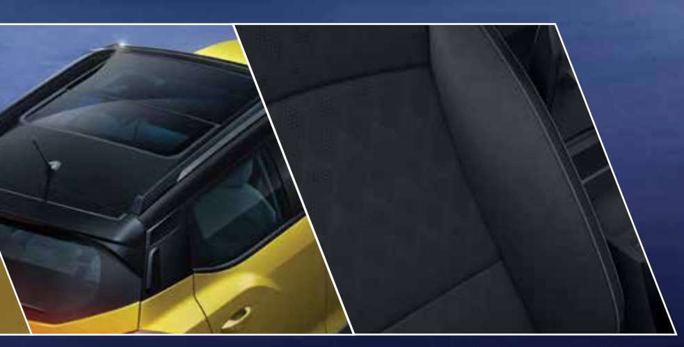
Panoramic Skyroof™ largest in its class

Its cabin boasts premium interiors with a soft-touch leatherette dashboard that extends to the door trims and leatherette seat upholstery to elevate the sense of sophistication. Leather accents on the steering wheel, gear knob and front armrest further enhance the premium feel.