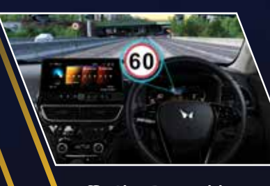
Traffic Sign Recognition