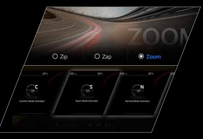
Smart Steering Modes (Standard from base)