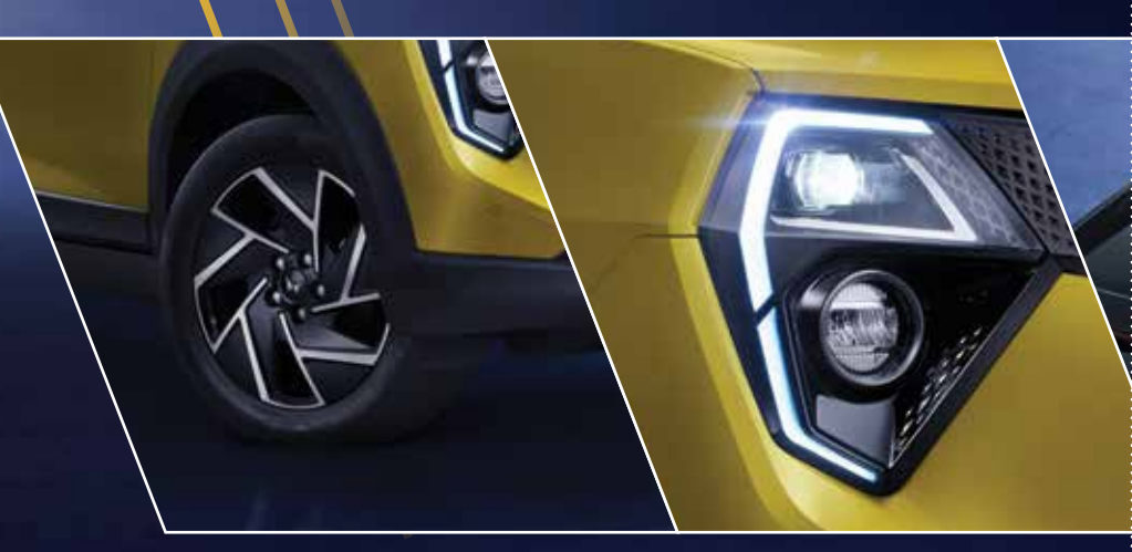
R17 Diamond Cut Alloy Wheels

Captivating LED Tail Lamps & Rear Infinity Light Bar